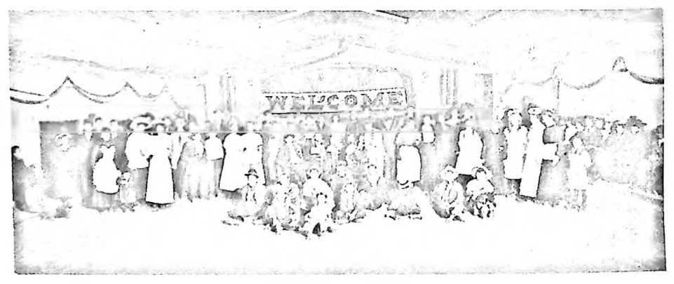
Kearney Roller Skating Rink, 1910.

The remodeled rink was not suited for play productions, or even for musical concerts. The acoustics were such that a program at one end of the building could not be heard at the other end, so performances were given near the center of the building. After the opening of the "new" opera house in 1891, the Model apparently reverted to its original purpose and became the Kearney Skating Rink.