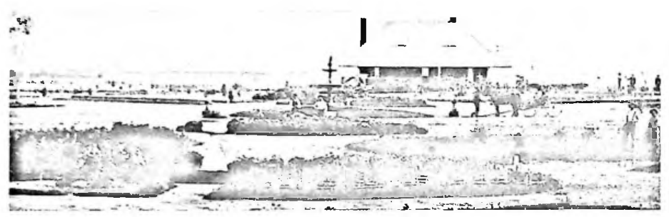
West Kearney, 1889

However, the key to the remarkable success of West Kearney was the securing of industries. The demand for brick brought about the enlargement of the Kearney Brick Company's yard, plus three new brickyards by the end of the year. An electric railway one mile in length was built to haul clay from the banks of the canal to the brickworks to speed up the brick-making operations.