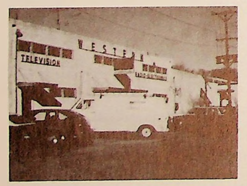
Western Manufacturing Corporation, 22nd Street and 14th Avenue.