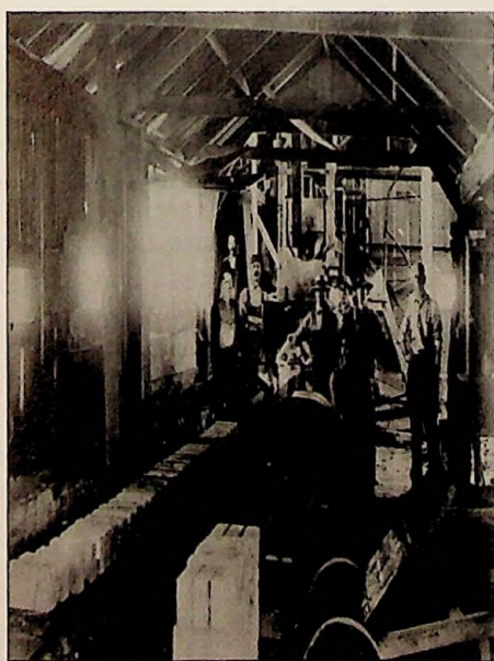
Photo of the Hibberd Brick Yard

Grandpa was a striking figure of a man. He stood well over six feet tall and probably weighed 250 pounds, with no fat. In later years he had a shock of