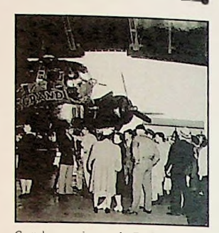
Crowd amasved to see the Boeing "5-Grand" during its stay at KAAB July, 1944

some time at the base for processing. With its black paint job and its stateof-the-art radar, the Black Widow was the first plane made specifically for night fighting.