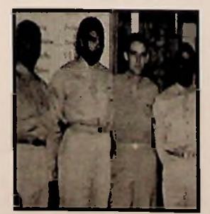
SQDN: C Orderly Room Staff July 2, 1945 Property of Buffalo County Historical So.