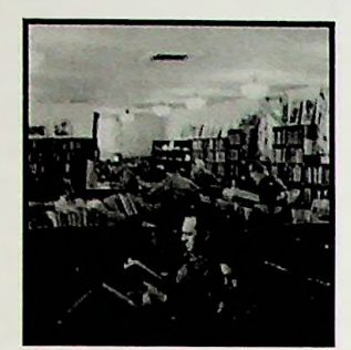
Inside Kearney Army Air Base Library May 15, 1945

raphy department at the KAAB (date unknown) Property of Buffalo County Historical So.