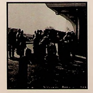
Troops arriving in Keamey, NE October 25, 1945