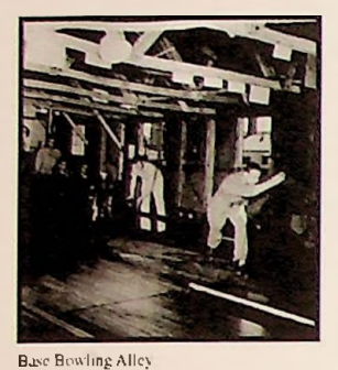
May 28, 1945 Property of Buffalo County Historical So.