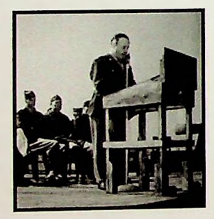
V-E Day Parade May 10, 1945

BUFFALO TALES is the official publication of the Buffalo County Historical Society, a non-profit organization, whose address is P.O. Box 523, Kearney, NE 68848-0523. Phone: 308.234.3041 Email: bchs@bchs.us