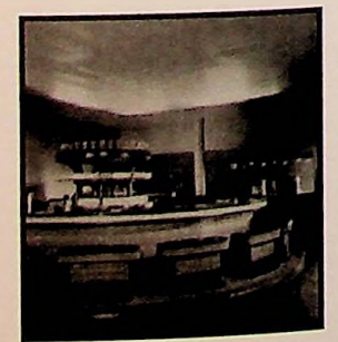
Non-Commissioned Officer's Club (NCO) Bar September 5, 1945 Property of Bulfalo County Historical So.