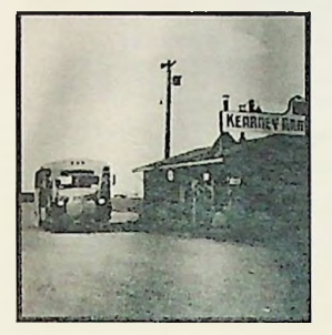
Main Gate of Kearney Army Air Field May 3, 1945