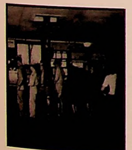
PX (Post Exchange) May 28, 1945 Property of Buffalo County Historical So

KAAB Photo album donated to the Buffalo County Historical Society Skylighters.org Wikipedia.com