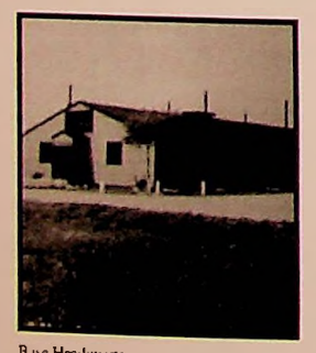
Base Headquarters July 20, 1945 Property of Buffalo County Historical So

The surrender of Nazi Germany and the Empire of Japan closed an