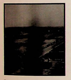
Parade at the KAAB date unknow Property of Buffalo County Historical So.