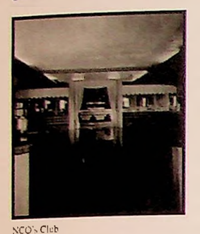
September 5, 1945 Property of Buffalo Coanty Historical Soc