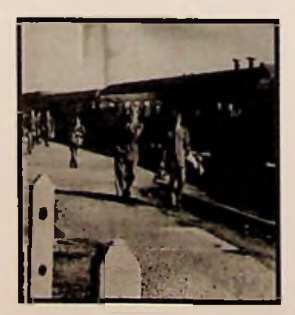
Troops arriving in Kearney NE October 25, 1945

While the majority of planes that passed through the KAAB were B-17 Flying Fortresses (pictured below) or B-29 Super Fortresses, this Northrop P-61 Black Widow (above) spent