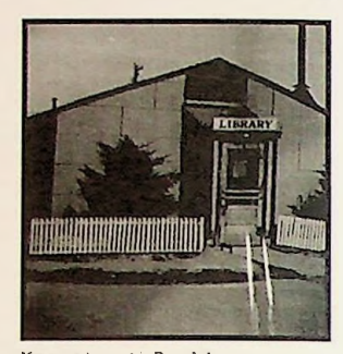
Keamey Army Air Base Library May 15, 1945

important era in American history. The war showed how a country's entire economy and the purpose of civilian life could be focused toward the war effort and toward supporting the troops overseas. A merican civilians had put in millions of hours and dollars building everything that the troops would need, from cloth for uniforms, to battleships, to airfields.