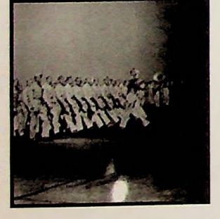
Parade at the KAAB (date unknown)