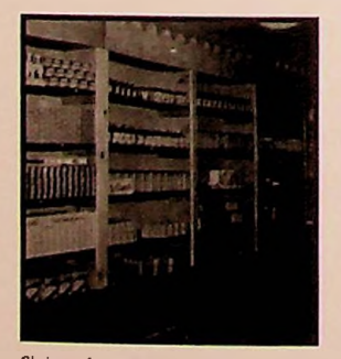
Shelves of supplies (date unknown)