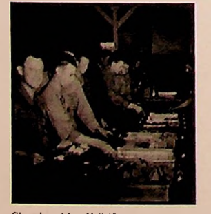
Chow Line Mess Hall #3 July 2, 1945