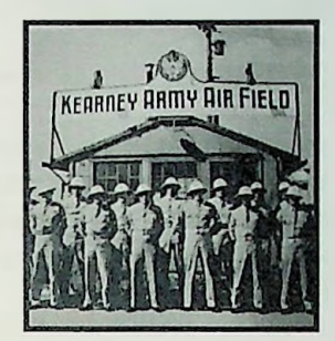
Military Police (lefi) September 13, 1945