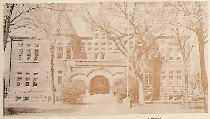
Longfellow High School, Kearney. 1890

To contrast even more the Gothenburg and Kearney booms, the residential sections of the two towns would only have to be compared. The residential sections of Kearney are full of fine Victorian houses that were put up during the boom period. Such is not the case in Gothenburg. Only a hand full of really nice houses were put