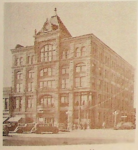
Kearney Opera House

Buffalo Tales" September 1986, January 1987, January 1989, January 1990, January 1991. Kearney Directory for 1889, 1891 and 1892. One Hundred Views of Kearney, Nebraska. 1892. Newspapers— Kearney Daily Hub. Gothenburg Independent and Keith County News, Ogallala. Records in Register of Deeds, Courthouse, Dawson County and Buffalo County, Nebraska. Gothenburg photos, Dawson County Historical Society and Gothenburg Public Library collections; Kearney photos from Anderson Collection, Buffalo County Historical Society Archives.