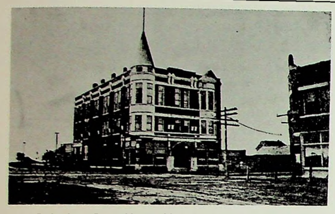
Gothenburg Opera House, 925 Lake Avenue, Gothenburg.

up in Gothenburg during the boom period and these do not compare too well with those of Keamey. There was a lot of house construction in Gothenburg during its boom period, but most were what could be termed cottages that were put up for the many expected factory workers. Most were put up by the Gothenburg Water Power and Investment Company.