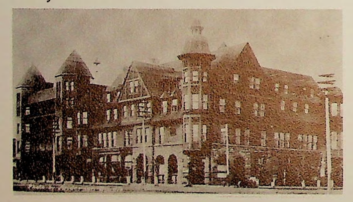
First Midway Hotel, Kearney

Then there were the contrasts between the booms of the two towns. In 1890, the Gothenburg boom started to take a different direction from Kearney's. In that year all the real estate companies in Gothenburg, including the Gothenburg Land and Improvement Company, were absorbed into one big company, the Gothenburg Water Power and Investment Company. There were a few Kearney men in this company, but most of the shareholderes were from Milwaukee. Individuals from Milwaukee had been increasingly interested in the Gothenburg boom, and it was not long before they dominated this new company. In fact, the Gothenburg Water Power and Investment Company was starting to dominate the town of Gothenburg itself; and, if the Panic of 1893 had not put an end to the boom, Gothenburg was probably destined to have become a company town. Kearney did not develop in this direction. No one company or organization really dominated its scene.