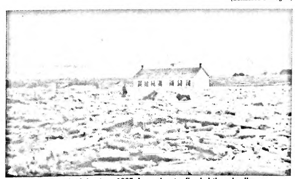
School south of the river, 1907. Ice and water flooded the schoolhouse.