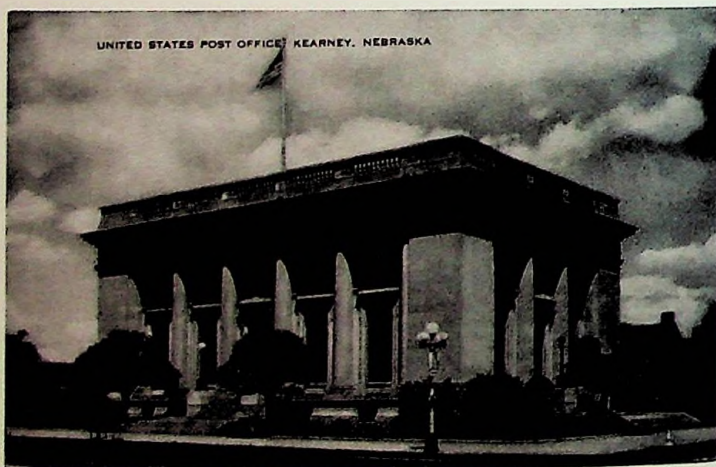
Postcard property of the Buffalo County Historical Society. Used with permission.

October, 1991 brought the ground breaking for the remodeling and addition.