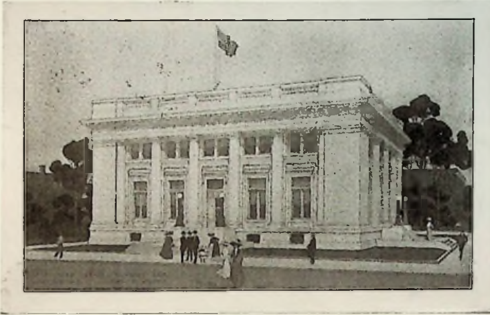
Sketch of the future Kearney Post Office, circa 1910. Caption: U. S. Post Office, Kearney NE, James Knox Taylor-Supervising Architect