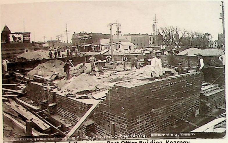
Caption: Starting foundation to new Post Office Building, Kearney, Nebr.