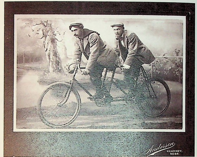
Men on Tandem Bike