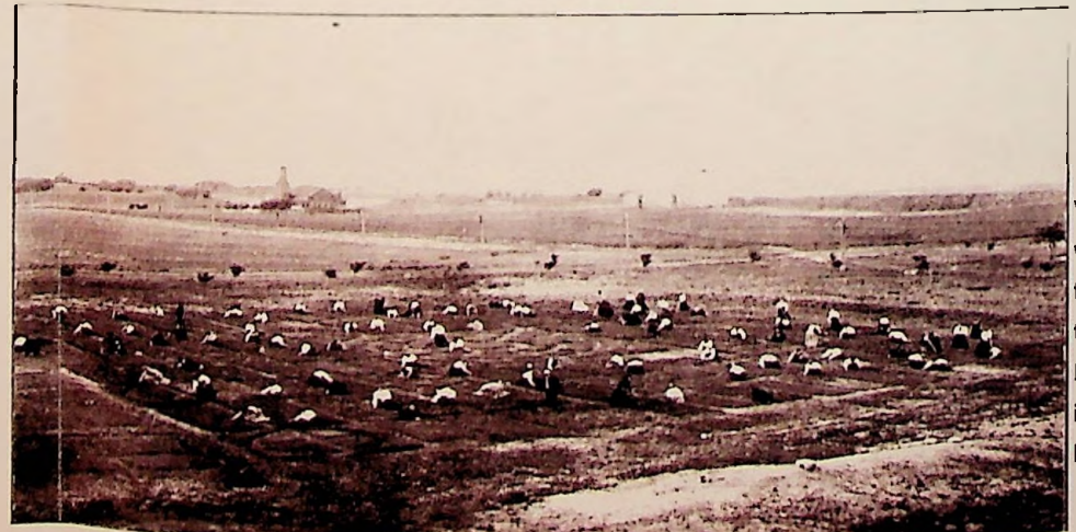
Women working in a field with the Kearney Power Plant in the background