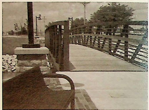
2nd Ave Pedestrian Bridge, Kearney, NE

extensions for new subdivisions, completing site development and architectural designs for many municipal and private development projects, and master planning for feasible growth opportunities for the future of the Kearney community as well as the 120-plus communities and organizations served across the State of Nebraska and Kansas, Miller & Associates has completed many exciting projects that have helped the City of Kearney grow and develop into the top-notch community