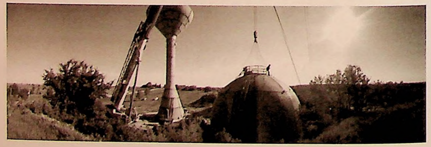
Water Tower Construction – Ravenna, NE

The role of firms like Miller & Associates is to take the community's vision and formulate a plan to bring the vision into reality in an innovative, timely and cost effective manner. M&A, a locally-owned, small business, is vital to the well-being of the rural areas of Nebraska and Kansas. The company provides quality products and services to communities, as well as jobs for families who live in the areas. Miller & Associates certainly does this in the five-office locations, but additionally the firm has the luxury of helping other communities grow and develop in a variety of ways to help maintain the way of life unique to the clients being served. Miller & Associates takes great pride in being able to foster and support this way of life for the communities and ultimately the families that call them home.