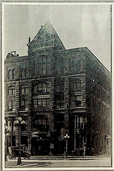
Kearney Opera House, 1891-1954