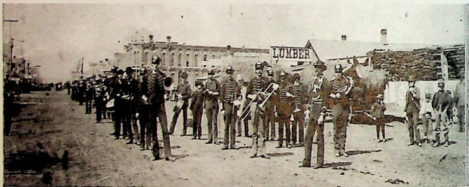
Band, Central Ave, Kearney, c 1880-1890s ?