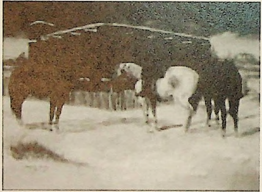
Hobbled at the Hacienda

But first I must see Jesus, fall humbly at his feet. For He’s the one who made the trail from here to there complete. You see the straight and narrow trail I do not always go And that presents a problem. The Bible tells us so. So Jesus came and gave His life. He died there in my place. He blazed the trail so I can see the Father face to face. So saddle up yer ponies boys and light the Master’s lamp Don’t get off the trail boys; we’re ridin in to camp.