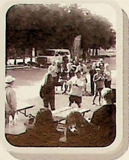
1/2 Marathon & 5K 2014