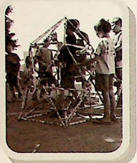
Students preparing for the cannon ball battle, Wild Science Fridays, 2014