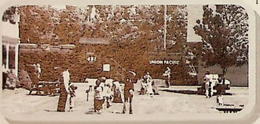
People enjoying activities at the annual Wagons West Celebration

Contest and worked on organizing accession numbers with donor sheets. She said that her favorite thing about working at the Trails & Rails Museum is "seeing the children who come into the museum that are so excited about learning! It's really cute!"