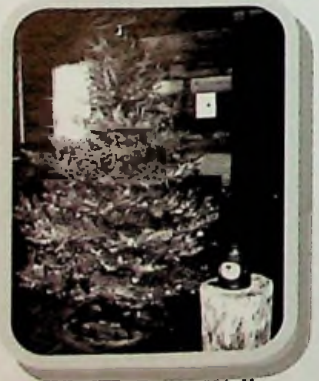
Christmas Tree Walk 2013