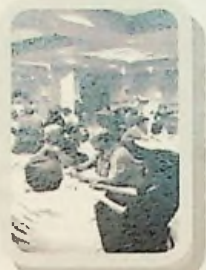
Teams competing during the 2013 trivia contest