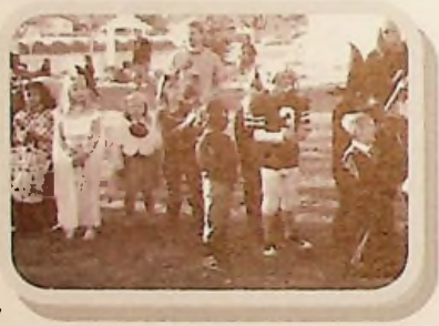
Kids waiting in line during the costume contest, Trick or Treating Around the Trails & Rails