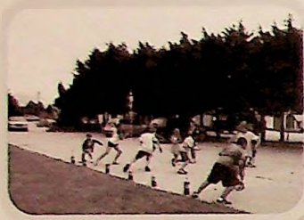
Dropping Mentos into Coke during the "There She Blows!" class. Wild Science Fridays, 2014