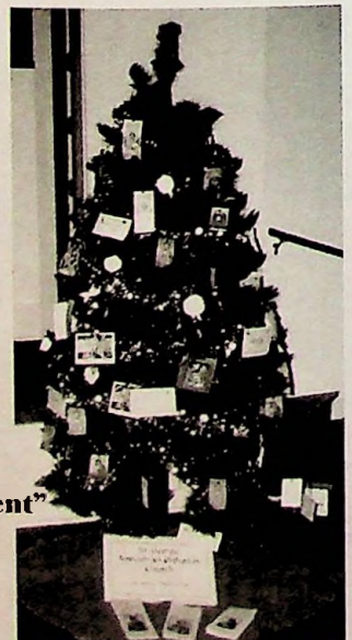
2005: Saint George Antiochian Orthodox Church- "Past & Present"