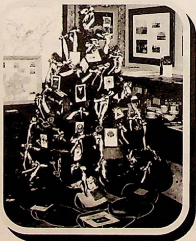
Trees from 1991: Patriotic tree (above) Buffalo Co. Extension Club (right)

Here is a look at some of the Christmas trees from the past 25 years.