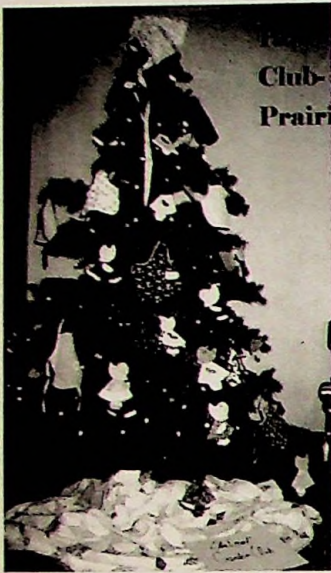
Elm Creek Garden Club- "Christmas on the Prairie" (left)