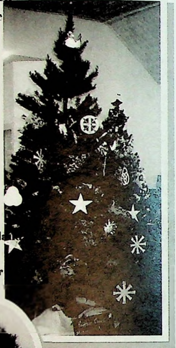
1994: BCIS- "Winter Wonderland" (right) 1994 (both lower right pictures)