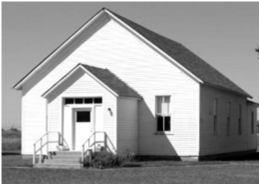
German Baptist Church of the Brethren was built in Kearney in 1898. It was originally located at 18th St and A Ave in Kearney. It is now located at the Trails & Rails Museum.

1898, the church decided to buy seven acres at 18th street and Avenue A. This would be ample room for a church building and for the horses and buggies as no one drove cars. The new church was dedicated in 1900 and had cost $1165. Early in the 1900's the German Baptist denomination divided into three groups. The most strict group remained German Baptist, the most modern became the Brethren Church and the middle group became known as the Church of the Brethren-thus, this group became the Kearney Church of the Brethren.